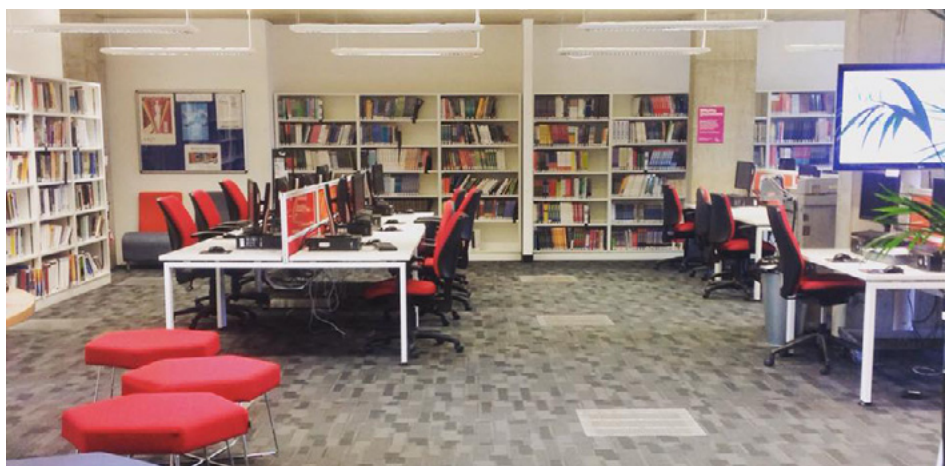
GCU London library – networking group

At the beginning of March 2015, a group of library professionals attended an inaugural meeting at the Glasgow Caledonian University (GCU London) campus. Nine librarians representing six London satellite campuses of UK universities were present – Coventry University, Glasgow Caledonian University, University of Liverpool, University of South Wales St Trinity, University of Sunderland and University of Ulster. Within the group we identified three different models of operation: a smaller branch of a larger UK institution, private sector and a subsidiary organisation providing the library services. From those represented at the meeting of London campuses the length of time they had been established varied from around six months to six years. All had similar portfolios, were heavily business focused, and some offered more specialised programmes.