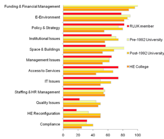
Figure 3. Top concerns over the next twelve months by type of institution

As in previous surveys, the similarities in response across the sub-groups were far more evident than any dissimilarities. As an example of this, the responses by type of institution show a broadly similar response to issues, despite the significant disparities in institutional type (see Figure 3).