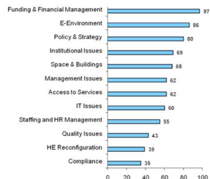
Figure 1. 2010 Top-concern percentages for the next twelve months

The top concerns of SCONUL directors and librarians over the coming year are summarised in the chart in Figure 1.