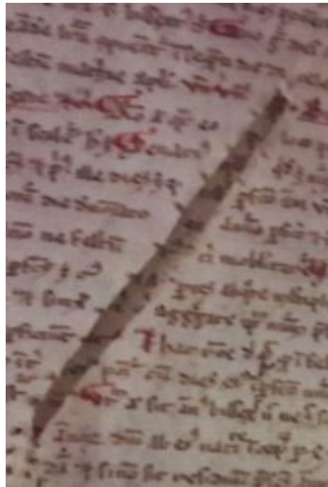
Figure 4 Hole in manuscript