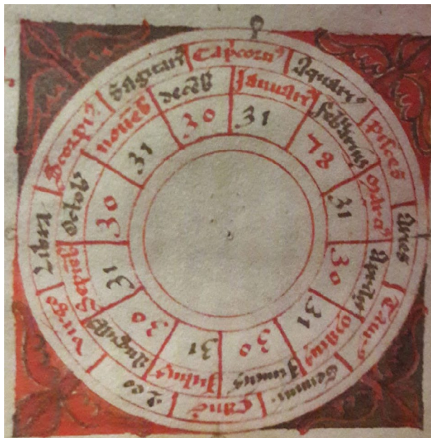
Figure 1 The calendar

Both texts are in Latin as relatively few works were written in the vernacular in the medieval West. Sacrobosco worked in the University of Paris in the twelfth century. This was one of Europe's premier universities and attracted students from many different countries. Latin was used as a scholarly lingua franca. The decline of Latin for scholarly purposes was very gradual – both Copernicus's De revolutionibus published in 1543 and Newton's Principia (1687) were written in Latin, which would have meant that both texts could cross linguistic boundaries in Western countries.