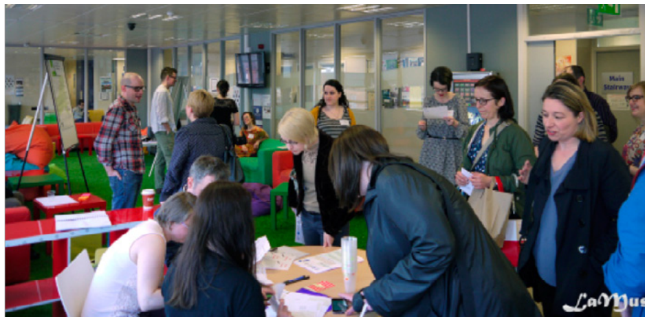
Registration for Library Camp 2016 at Dublin Business School