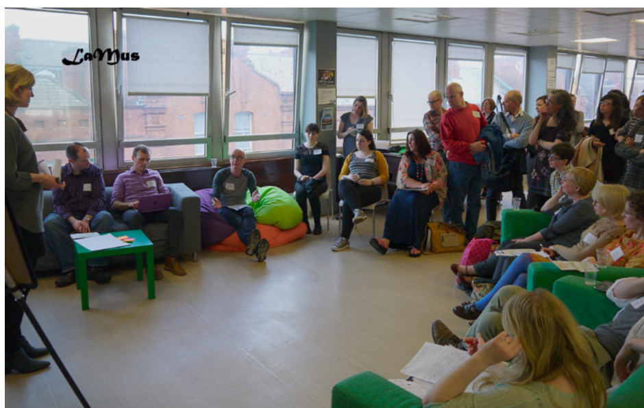
Library Camp 2016, held at Dublin Business School