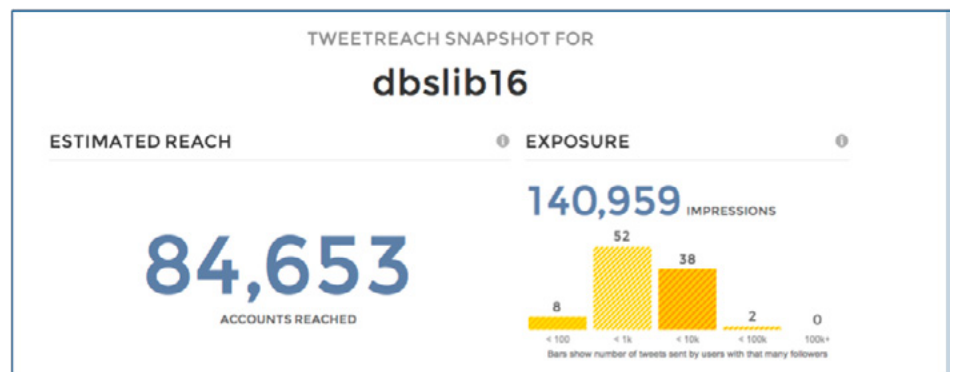
Fig. 1 Twitter analytics for DBS Library's annual seminar