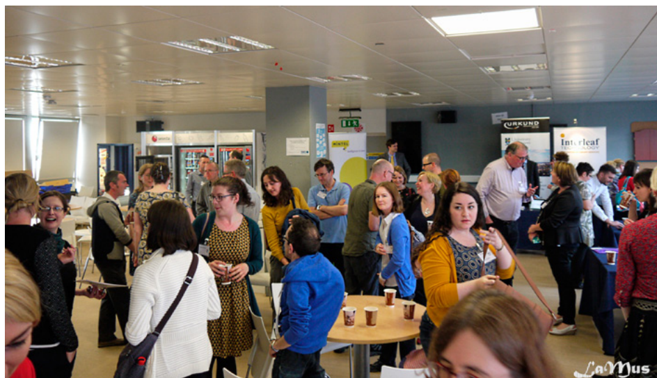
Delegates at DBS Library's Annual Seminar 2016