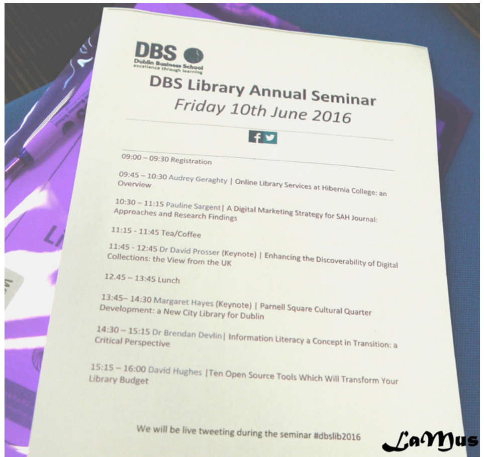
Line Up- DBS Library Seminar 2016

To date the majority of queries the college has received pertain to records management and IT modules as library professionals seek to upskill regarding the legal side of records management and the changing IT landscape of libraries (growth of cloud computing, etc.)